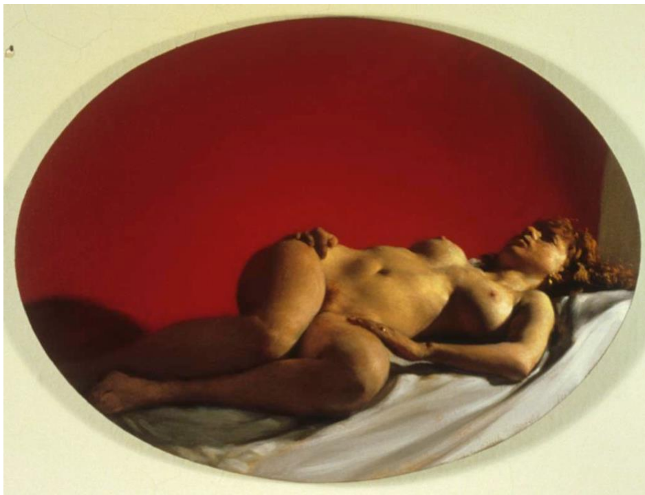
Figure Painting in Oil

15 Day Figure Painting: August 19-September 6, 2024