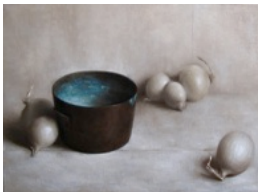
Composition with Copper Bowl & Onions