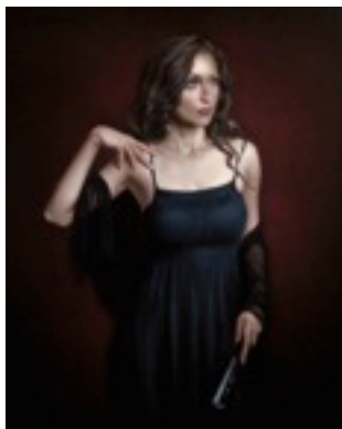
The sphinx without a secret