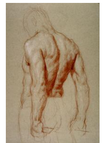
Man pulling large